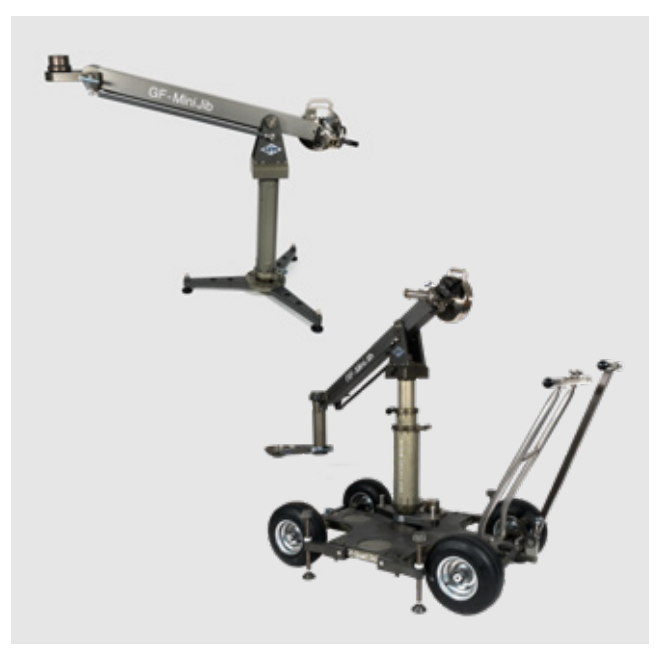
Different camera mounting positions

Its counterweight arm can be steplessly adjusted by a crank and extended up to a max. of 100 cm. A user-friendly brake attached to the end of the GF-Mini Jib also serves as friction, depending on the tight-ening torque. Most Jib Arm components are made of aluminium and have a very hard and durable surface protection [Hart-Coat®].